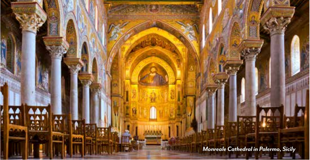
Monreale Cathedral in Palermo, Sicily