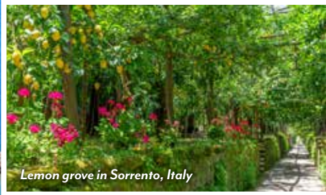
Lemon grove in Sorrento, Italy