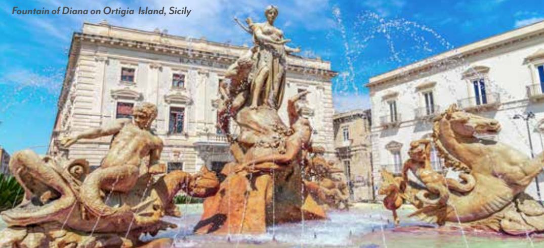
Fountain of Diana on Ortigia Island, Sicily

Visit Palermo's Baroque square and the 12th-century Duomo of Cefalù cathedral. Step inside the Palatine Chapel, a 12th-century masterpiece that reflects Sicily's diverse origins with European, Sicilian, Byzantine and Arab influences. At the Capo market, see revered Palermo street food and admire colorful stalls. After a tasting nearby, visit the UNESCO-designated Cathedral of Monreale — one of the greatest examples of Norman architecture and known for its Byzantine mosaics. (B,D)