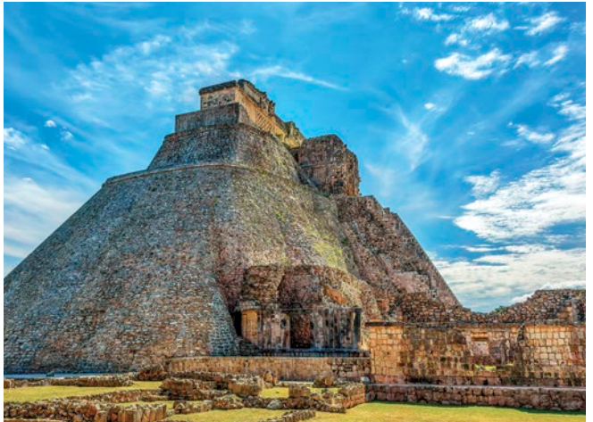
Pyramid of the Magician, Uxmal