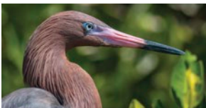
Reddish egret, Celestún