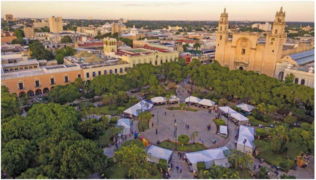
Cathedral and Plaza Grande, Mérida