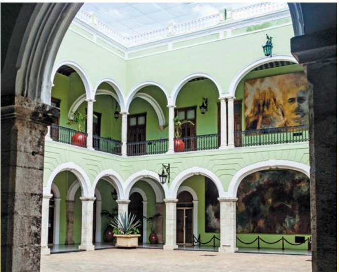
Murals, Palacio del Gobierno de Yucatán, Mérida