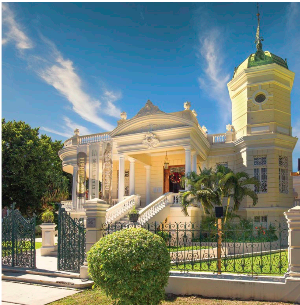
Architecture along Paseo de Montejo, Mérida