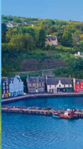
Brightly painted houses overlook the harbor.

Blooming with more than 6000 exotic plant species, this subtropical landscape is built around the ruins of a Benedictine Abbey. Walk among spires of indigo viper's bugloss, broad-leaved tree ferns, flourishing aloes and bright pink South African suikerbos . Visit the garden's Valhalla Museum, home to an eclectic collection of 60 shipwrecked figureheads recovered across the Isles of Scilly.