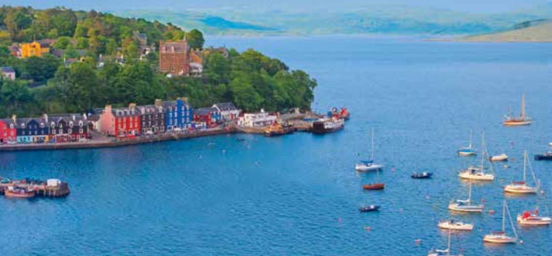
the sheltered sound in the colorful fishing port of Tobermory.

Stroll through the serene, restored abbey and see the churchyard's intricate Celtic crosses.