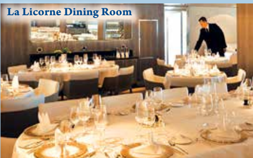
La Licorne Dining Room