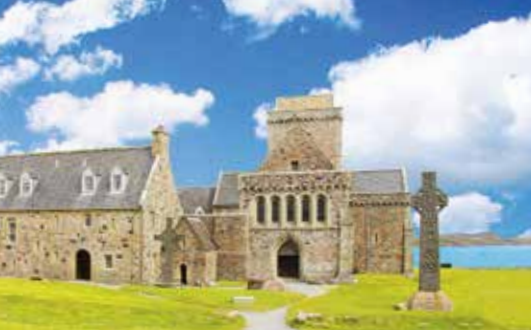
Iona Abbey, Scotland's holiest place since the sixth century, is traditionally believed to be where the Book of Kells was created.

RESPONSIBILITY: Main Line School Night, its agent, Engaging Journeys, Inc., Gohagan & Company, and its and their employees, shareholders, subsidiaries, affiliates, officers, directors or trustees, successors, and assigns (collectively "Gohagan"), do not own or operate any entity which is to or does provide goods or services for your trip including, for example, lodging facilities, airline, vessel, or other transportation companies, guides or guide services, local ground operators, providers or organizers of optional excursions, food service or entertainment providers, etc. All such persons and entities are independent contractors. As a result, Gohagan is not liable for any negligent or willful act or failure to act of any such person or entity or of any other third party.