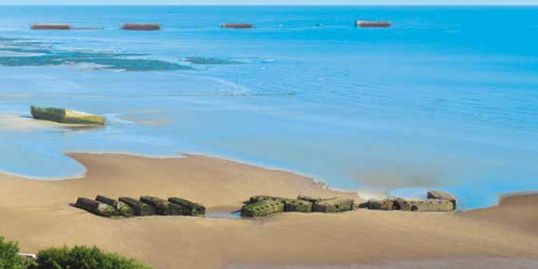
Photo this page: Remnants from D-Day are still visible at man-made Mulberry Harbor, including anchored "Beetle" pontoons.

Cover photo: Admire Eilean Donan, one of the world's most evocative castles, steeped in Jacobite history.