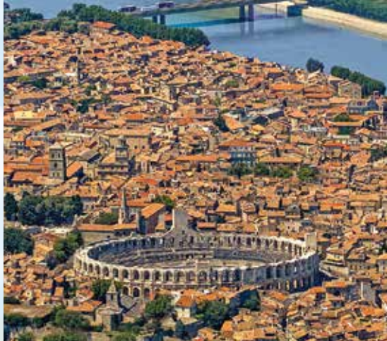
Arles' Romanesque architecture reflects its history as a vital port on the Roman road from Italy to Spain.

See the Triumphal Arch, built in the late first century in testimony to Augustus Caesar and Roman imperial glory.