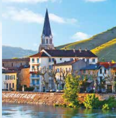
The Rhône Valley vineyards thrive on both of the most famous wines.

Located along the banks of the Saône River, this internationally acclaimed wine region has been known to produce more red wine than the Burgundy vineyards of Chablis, Côte d'Or, Côte Châlonnaise and Mâconnais combined.