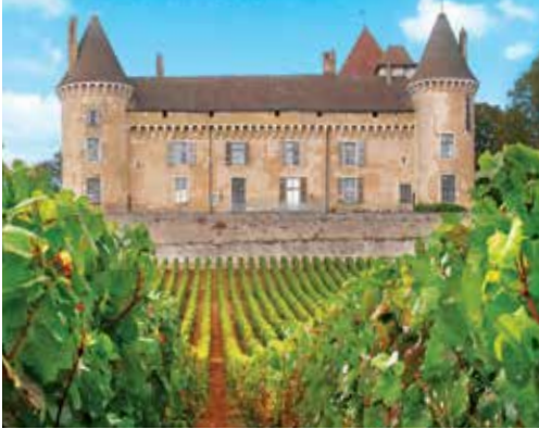
Look for rustic châteaux and verdant vineyards scattered throughout the French countryside.

RESPONSIBILITY: Main Line School Night, its agent, Engaging Journeys, Inc., Gohagan & Company, and its and their employees, shareholders, subsidiaries, affiliates, officers, directors or trustees, successors, and assigns (collectively "Gohagan"), do not own or operate any entity which is to or does provide goods or services for your trip including, for example, lodging facilities, airline, vessel, or other transportation companies, guides or guide services, local ground operators, providers or organizers of optional excursions, food service or entertainment providers, etc. All such persons and entities are independent contractors. As a result, Gohagan is not liable for any negligent or willful act or failure to act of any such person or entity or of any other third party.