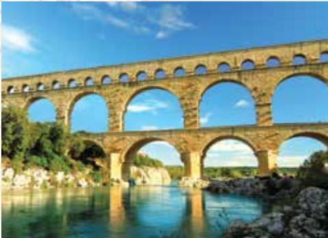
The first-century Pont du Gard aqueduct was built with 55,550 tons of soft limestone blocks.

The city's colorful houses, bathed in golden light, inspired Van Gogh, who produced over 200 works during his 14-month stay in 1888, including The Sunflowers and The Café Terrace at Night —the café on Place du Forum is still open to the public. Enjoy the afternoon at leisure.