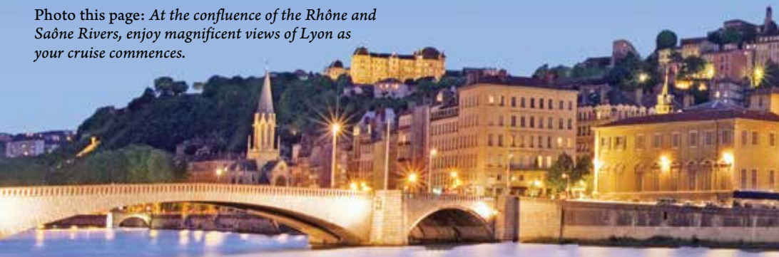
Photo this page: At the confluence of the Rhône and Saône Rivers, enjoy magnificent views of Lyon as your cruise commences.

Cover photo: Cruise past the medieval town of Tournon-sur-Rhône, surrounded by undulating, verdant vineyards.