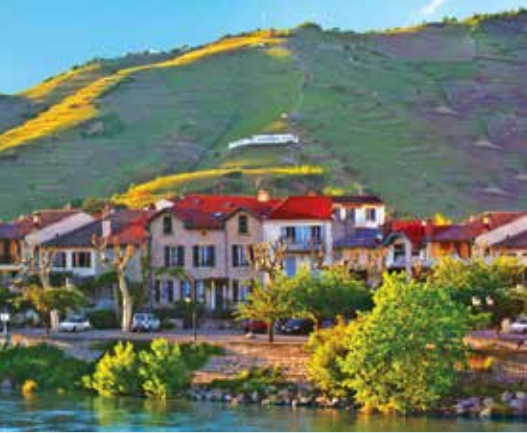
ides of the river, producing some of the world's

The city's colorful houses, bathed in golden light, inspired Van Gogh, who produced over 200 works during his 14-month stay in 1888, including The Sunflowers and The Café Terrace at Night —the café on Place du Forum is still open to the public. Enjoy the afternoon at leisure.