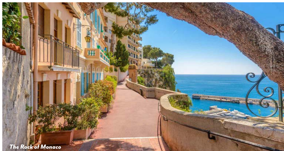
The Rock of Monaco

For reservations, call Gohagan & Company at 800-922-3088 or visit gohagantravel.com/reserve