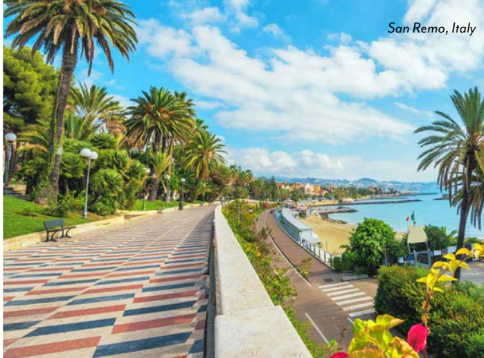
San Remo, Italy

your own plans for lunch. This afternoon, embark the deluxe Sea Cloud Spirit , a unique, luxurious tall ship.