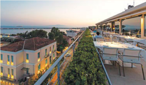
Pharae Palace Hotel | Kalamata