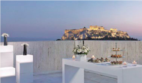
NJV Athens Plaza Hotel | Athens